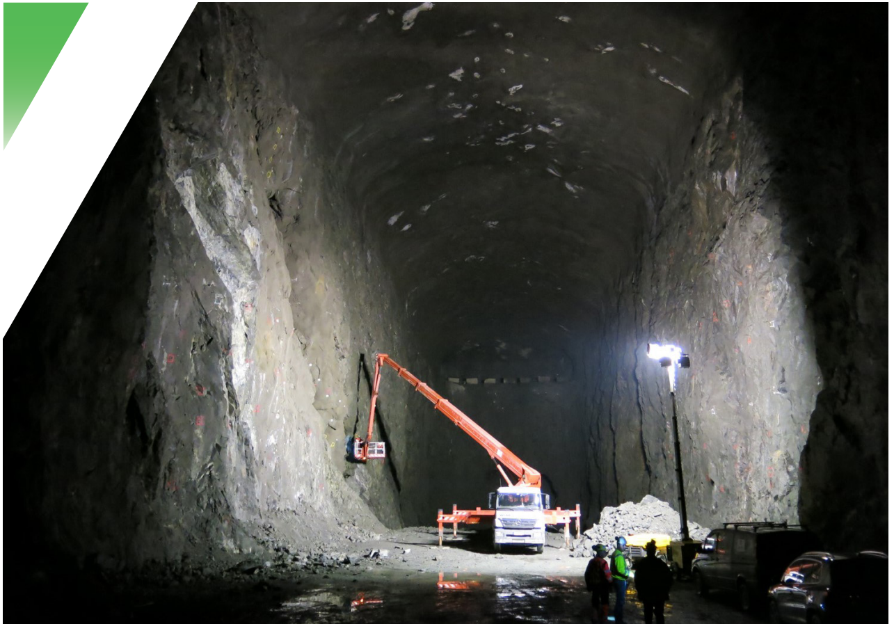
Rock bolting cavern wall

Stendafjellet is located 8 km south of Bergen city centre, where FSG is operating an underground quarry and crusher plant. Excavated rock volumes are later used as depositing sites for contaminated soil and waste with low organic content. All urban societies are consumers of crushed rock, and produce waste and polluted materials. The operation shows that it is possible to excavate caverns with large vertical dimensions at low costs in area with high level of urban development. The facility has been in operation for about 15 years with economical results enabling the operation to expand, and with full approval by the environmental authorities.