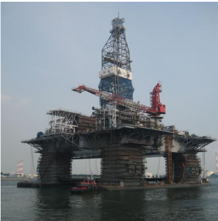
Plattform overview